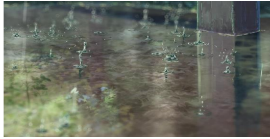
Figure 5. Photorealistic Animation of Raindrops in the Garden of Words (Garden 00:08:05/00:45:51)