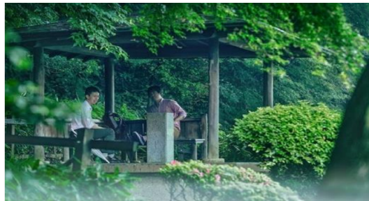
Figure 3. Photograph of Shinjuku Park in Japan, Illustrated in the Animation (Shinjuku, 2013, [9]).