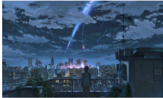
Figure 8. Animation Depicting the Vibrant Tokyo City with Bright Lights in Your Name (Your Name 01:28:59/01:46:35)

For Shinkai, character drawings seem to be a secondary consideration. However, as a storyteller, his background goes beyond simply being the places where the characters appear to live on screen. Those backgrounds can set up tones, mood, and atmosphere but most importantly the backgrounds are the window in the setting wherein can be a great visual representation of the character's emotions. For instance, the camera frequently focuses on skylines, isolated items, and landscapes in The Garden of Words rather than on people in the scenario. This underlines the theme of isolation and distance between characters [15].