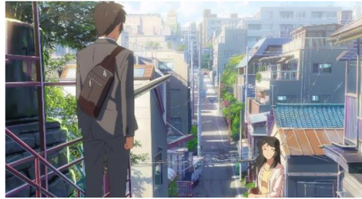
Figure 2. The Animated Version of the Real-Life Staircase in Your Name (Your Name 01:40:46/01:46:35)