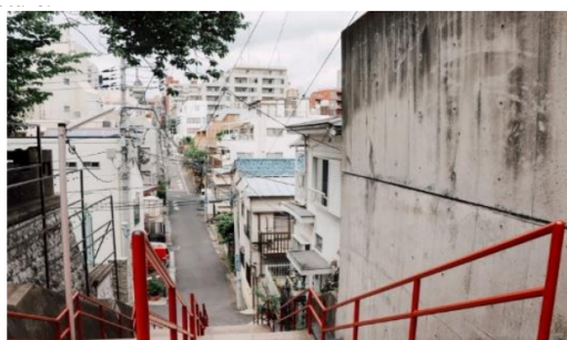
Figure 1. Real-Life Staircase Location in Japan, which is Depicted in Your Name (Soriano, 2020, [12]).

There is no doubt in saying that his name will go down in history, separating him from his contemporaries not only for the reasons of do-it-yourself filmmaking but also for his art style, contemplative themes, focus on representing the detailed surroundings, lighting, colour theory, matching the moving pictures with identically defined synchronization sounds, and compelling music. His work attempts to ground you as firmly as possible into reality, despite metaphysical elements and dreamlike animation. He, similar to other modern animators makes use of some of the real locations of Japan in their animation drawings, where nearly every external location is a photo-accurate representation of a real world place. However, the stunning and shockingly accurate scenes borrowed from reality in Shinkai's real-life anime have made a sensation worldwide causing hundreds of fans to fly across the globe to visit the locations sketched in his film, for example, the iconic staircase (e.g. "Fig. 1" and "Fig. 2") in Your Name [12]. While other directors were inching toward more accurate drawings, Makoto Shinkai was clawing beauty out of the most mundane everyday sights and putting them on display from a perspective only he could capture.