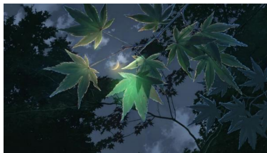
Figure 9. Animation of Moonlight Shining Through Leaves in the Garden of Words (Garden 00:24:31/00:45:51)

Shinkai turns every day into the fantastical. He delights in everyday things that are often ignored (e.g. "Fig. 9" and "Fig. 10"), the way light reflects on a body of water, how it bounces off a faucet, or how snow sticks to a train window, rainwater beating up a twig branch, and dropping of petals from a tree, all those details contribute to the emotional buoyancy and that melancholy explored in these films.