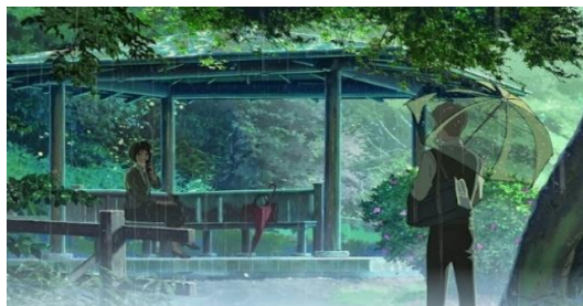
Figure 4. Animation of the real-life park in The Garden of Words (Garden 00:02:29/00:45:51).

Shinkai clicks photographs and uses them as references for his artwork that shines through his drawings, providing an incredibly accurate depiction of real locations. His unique realistic art style, that is, photorealism, brought him to blur the line between animation and reality in his works. This photorealistic art style is suggestive in his depiction of one of the (e.g. "Fig. 3" and "Fig. 4") National parks of Japan in The Garden of Words [13]. The quirks in his art style separate him from his peers. The nuanced detail in each of his scenes, his gorgeous meticulously animated food, infatuations with weather, the theme of love and the melancholic, and the use of soundtracks purposely arouses the highest amount of emotions but above all else, it is his visuals that shows how he perceives the world beyond and around himself. For showing photorealism, which is the core of his visual style, he goes beyond artistic conventions and gives photorealistic detail to all the drawings, converting them into scenes from different angles. This provides a sense of capturing the world through the lens instead of a simple 2D drawing and bringing a depth of reality to all the little things that people miss to observe in their daily lives.