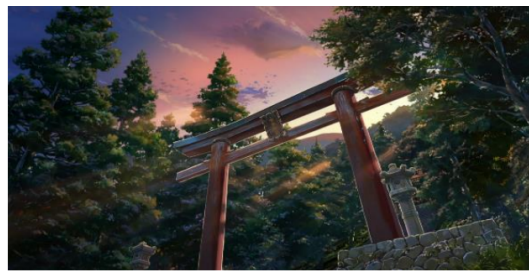
Figure 6. Use of Lighting and Tyndall Effect in Animation Your Name (Your Name 00:13:10/01:46:35)

By making the foreground and background of his animation appear unfocused, much like real-life cameras, he adds depth of field (e.g. "Fig. 5"). Another important factor contributing to such an impression is light reflection. The way light interacts with the surroundings in his films is one way to recognize his works (e.g. "Fig 6"). If his movies had taken place in a generic setting, they wouldn't have had the same impact. His trademark photorealistic style helps create a more immersive and relatable universe that reminds the viewer that even with all the supernatural elements the movie is still rooted in humanity. His pursuit of realism is not just a hollow attempt at live action, he states that the setting of a film must allow the viewer to rediscover the beauty of places or nature [14]. The way he meticulously showcases Tokyo as grand and scary, filled with blinking lights and skyscrapers, highlights the bustling world and beauty of restless culture (e.g. "Fig. 8"). While not only provides the perfect depiction, but he also provides a hyper-idealised depiction, with bright clean cities and countryside. Nature is shown in almost every frame for the portrayal of an isolated town (e.g. "Fig. 7"). Its reality is presented with vibrant green and warm reds. Also, his portrayal of the weather charms and manages to spread the exact feeling of what it would be like to visit there.