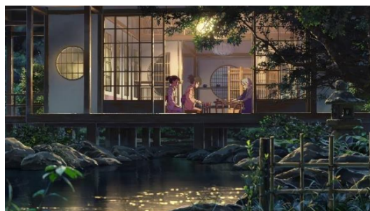
Figure 7. Illustrating the Nature of the Countryside with Soft Light in Your Name (Your Name 00:29:56/01:46:35)

By making the foreground and background of his animation appear unfocused, much like real-life cameras, he adds depth of field (e.g. "Fig. 5"). Another important factor contributing to such an impression is light reflection. The way light interacts with the surroundings in his films is one way to recognize his works (e.g. "Fig 6"). If his movies had taken place in a generic setting, they wouldn't have had the same impact. His trademark photorealistic style helps create a more immersive and relatable universe that reminds the viewer that even with all the supernatural elements the movie is still rooted in humanity. His pursuit of realism is not just a hollow attempt at live action, he states that the setting of a film must allow the viewer to rediscover the beauty of places or nature [14]. The way he meticulously showcases Tokyo as grand and scary, filled with blinking lights and skyscrapers, highlights the bustling world and beauty of restless culture (e.g. "Fig. 8"). While not only provides the perfect depiction, but he also provides a hyper-idealised depiction, with bright clean cities and countryside. Nature is shown in almost every frame for the portrayal of an isolated town (e.g. "Fig. 7"). Its reality is presented with vibrant green and warm reds. Also, his portrayal of the weather charms and manages to spread the exact feeling of what it would be like to visit there.